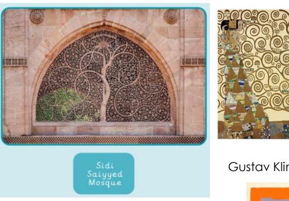
Gustav Klimt – The Tree Of Life

Tree of life represents all of nature. Lots of cultures have stories about the tree of life.