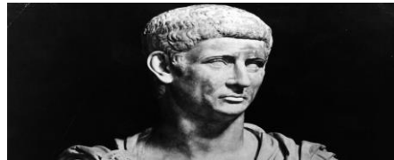
The Roman Emperor Claudius.

In AD 43, the Roman emperor Claudius launched an invasion of Britain, and over the next 45 years the Roman army gradually extended its control over much of present-day England and Wales and ventured into territory now in Scotland.