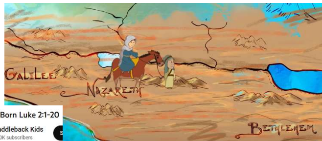
Jesus is Born Luke 2:1-20 Saddleback Kids 680K subscribers